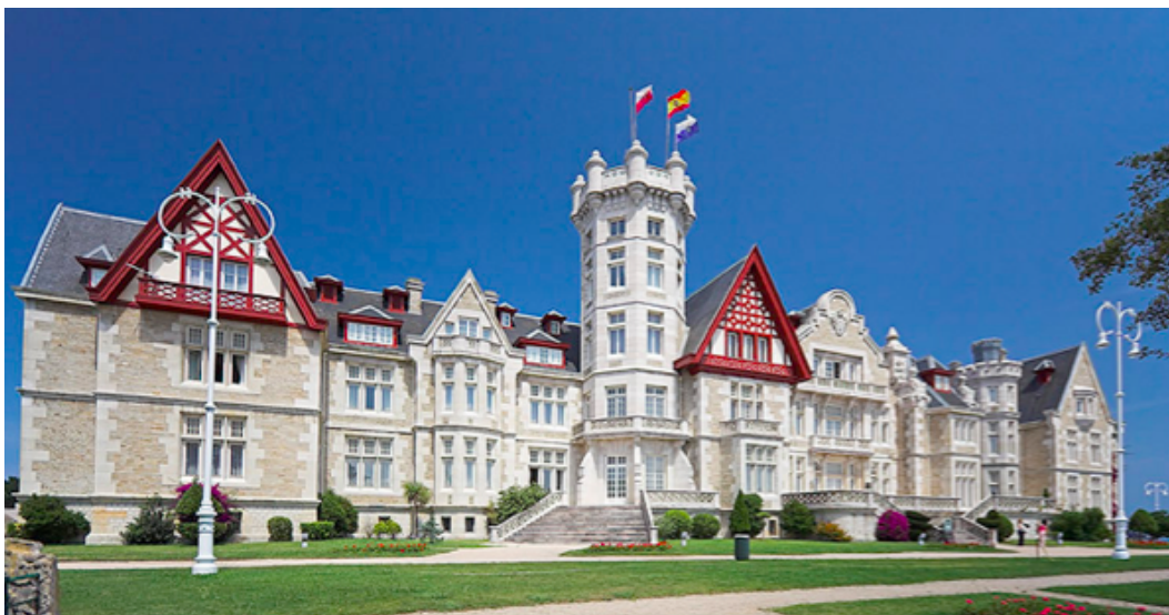
The Royal Palace of La Magdalena: southern view.