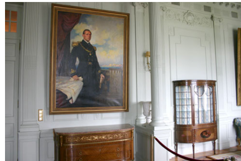
The Royal Palace of La Magdalena: (left) Royal Hall; (right) detail of a room.