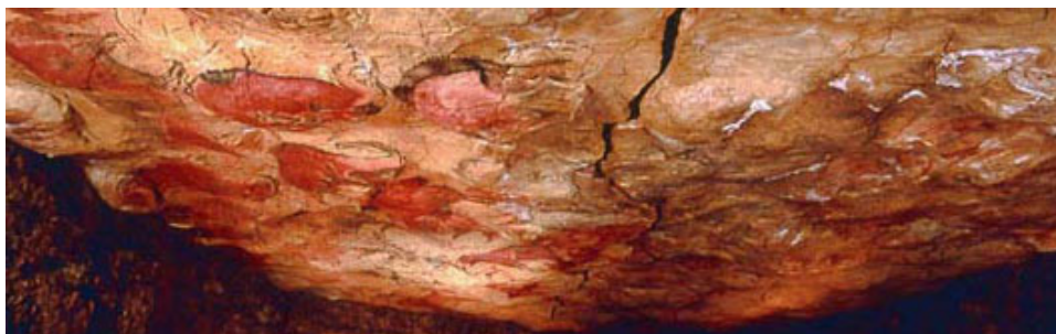
Altamira Neocave: a high-technology realistic replica of the real cave.