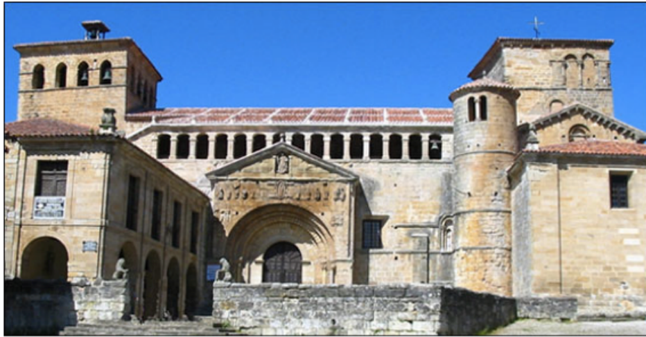
Santillana del Mar: Collegiate church of Santa Juliana