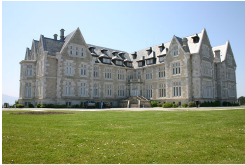
The Royal Palace of La Magdalena.