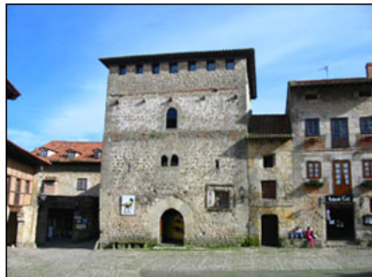
Santillana del Mar: (left) Tower Don Borja; (right) Tower of Merino.