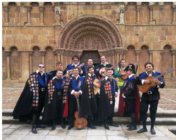
University tuna in Santillana del Mar.