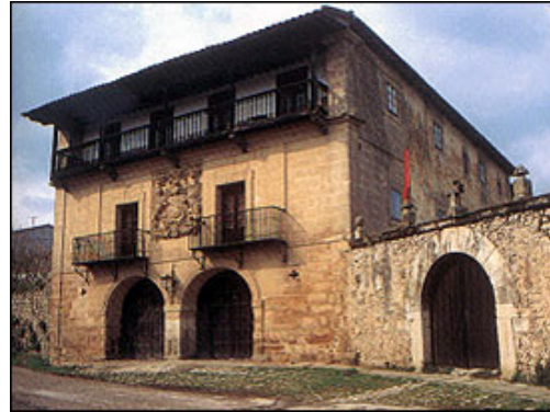
Santillana del Mar: (left) Don Borja Tower Coat of arms (Quevedo-Cossio); (right) Tagle House.